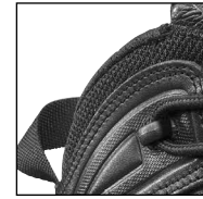
HAIX® Climate System