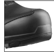
HAIX® Composite toe cap